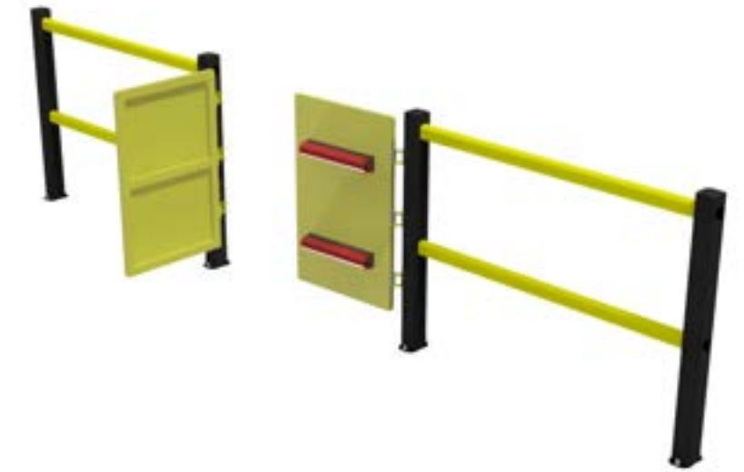
IMPACT DRIVE GATE

All our models can be customised to meet your requirement. We can accommodate any pallet size, as well as any height. Some gates are better suited to specific needs, Our friendly sales team will be able to help find the right one for you!